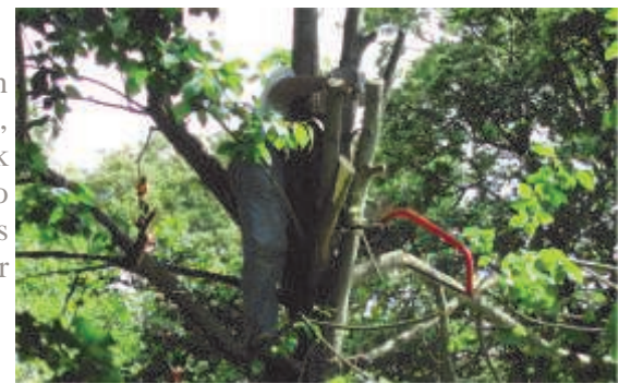
Tree work at Walberton

At Walberton, we have been gradually putting in platforms, particularly in areas where the bank has worn away. We have also had to deal with a couple of fairly large trees that have come down, in particular one on the island of Stemps.