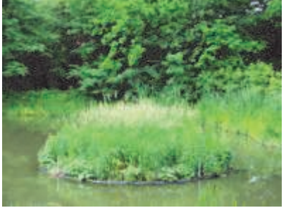
A floating island

Having drained this down and removed the fish to the match lake it is now naturally refilling. This has been a bit stop and start as despite a pretty poor summer we have not had a great deal of rainfall, however it should be ready for when we plan to restock the pond. We have placed orders for a significant number of carp including some