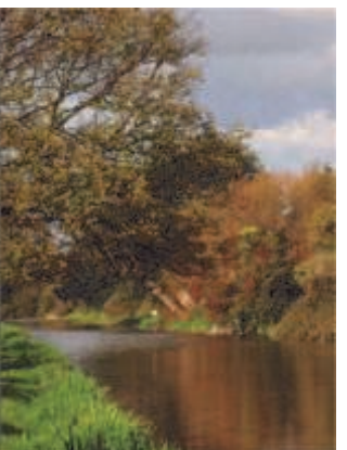
Issue 4 - Autumn 2010 The Rother at Fittleworth with low water levels