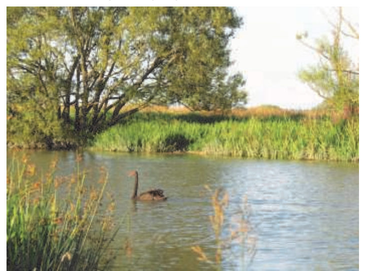
While waiting for barbel, there's always something to see elements. And then,

heard tales of them coming from another stretch, and there were rumours of very big fish. I also met other barbel anglers who, like me, had plugged away unsuccessfully at Watersfield for years - yes years.