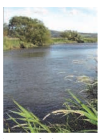
Issue 3 - Spring 2010 Watersfield, was the subject of this issue, this picture was taken iust downstream of the sluice