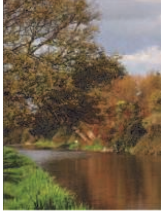
Issue 5 - Spring 2011 The Chichester Canal about half-way between Hunston and the by-pass