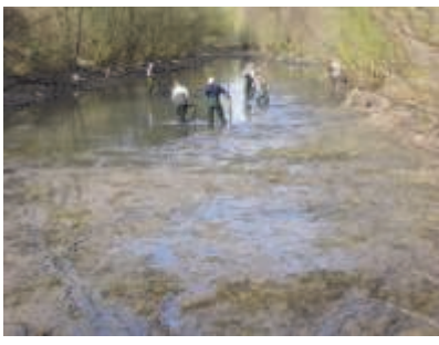
An almost empty carp pond

fish that will be close to 20 lb. These will be