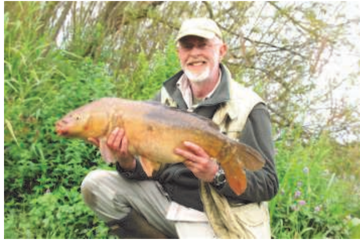
My 18 pound carp from Bury on the Arun

eleven pounds, and it came on 21 July 2009. It was a wet and windy afternoon, and the fish took a big bait (two large halibut pellets glued to a hair). Once I'd hooked into it, there was no