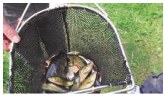
Some of the crucian carp and tench

As well as the stocking that we will be making to the carp pond we have already introduced some more crucian carp and tench to the tench pond and also some silver fish including skimmer bream to the match pond. These fish certainly seemed to have paid dividends as we have had very good reports from anglers fishing both ponds.