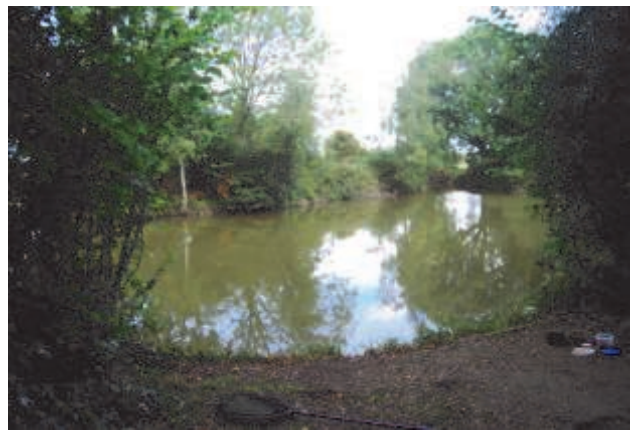
Try close in on Peg 7

We then come to a peg that is a particular favourite of mine and others - peg 7. Although you can fish the island (aim for the tree) or the open water, the place to try is tight in, 2 or 3 metres from the bank for the quality roach. During the summer feed hemp and fish caster, corn or my old favourites tares. In the winter a bit of ground bait with chopped worm and a piece of worm on the hook