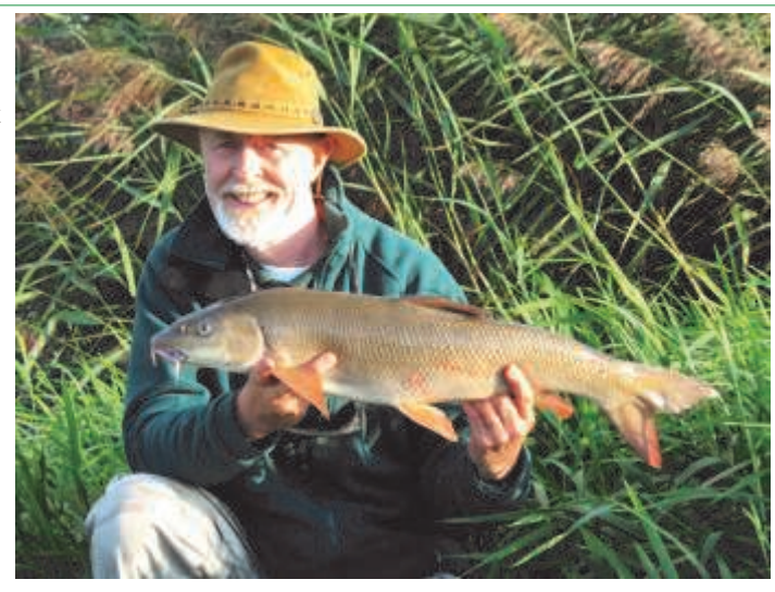
Obviously my lucky hat - the second Arun barbel

with, but my mobile phone took a bit of a bashing as I fired off text messages to various mates. Eventually, without recasting, I packed up and set off for home, content in the knowledge of a mission accomplished. As so often happens, when you break your duck, another one soon followed, but by soon I don't mean in the next session or two. but rather some six weeks later when a splendid 7-14 from a different swim graced my net.