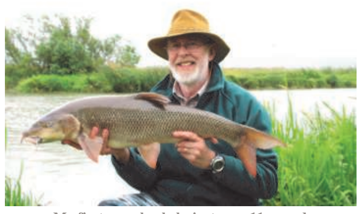
My first arun barbel - just over 11 pounds

eleven pounds, and it came on 21 July 2009. It was a wet and windy afternoon, and the fish took a big bait (two large halibut pellets glued to a hair). Once I'd hooked into it, there was no