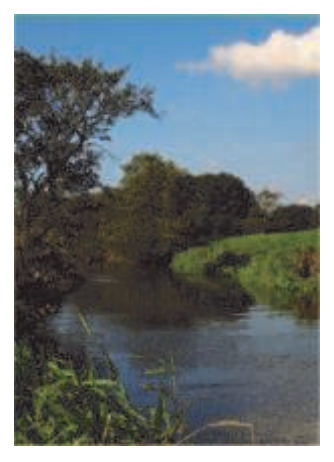
Issue 1 - Spring 2009 Featured our Coates stretch of the Rother which was then our newest water

If you've ever wondered where our cover pictures have been taken now's the time to find out.