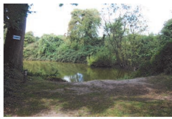
Plenty of options on Peg 1

As you arrive the first bit of water you see is the renowned peg 1, always popular this swim offers a variety of options for carp or a more relaxing silver fish session For the carp the bushes to the right and immediately in front of you, tight to the island or tight in to your left are all good options. In the summer pellet or corn over loose fed pellet and a