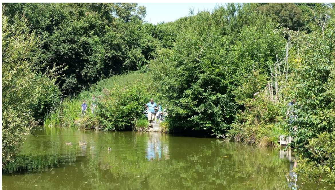
Fishing starts at the Junior Tuition Day

Having seen this, the participants were raring to go and could not wait to get back to their swims to try for themselves. Each pair of junior anglers was allocated a helper and back at the swims final preparations were made and the first lines were cast to the water. The fish were on form and obviously hungry as within minutes fish were being caught all round the pond. Our maggot shy young lady was furnished with an alternative bait and she caught a few fish on this. In the meantime one of the helpers had raided his tackle box and come up with a rubber artificial maggot; this was tried and proved successful. Fishing continued until lunch was called and everyone sat down for some food and a drink.