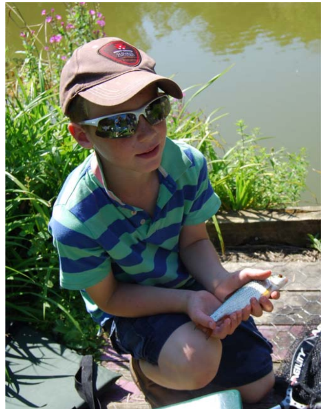
This is what it's all about two happy junior anglers show off their fish