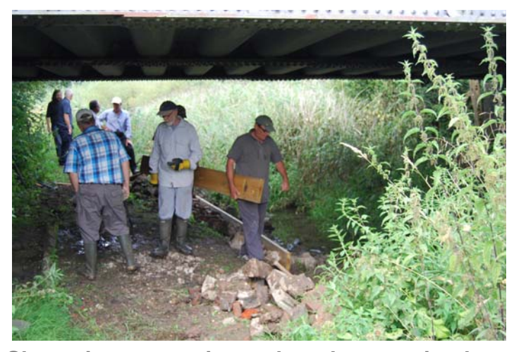
Shuttering cut to size and ready to put in place, you can see the size of the rocks that were removed in the foreground