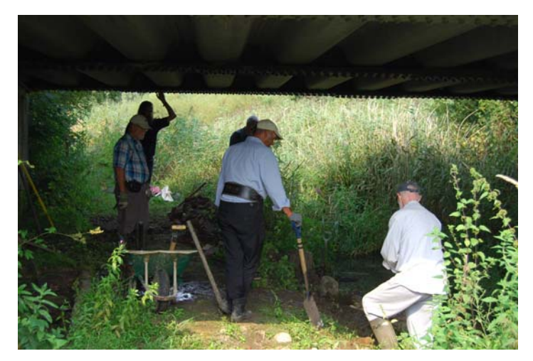
Work gets underway

The plan was to put some shuttering in on the stream side, lift all the bricks, lumps of concrete and rocks that were standing proud, fill in the holes and then once this had settled lay a top dressing.