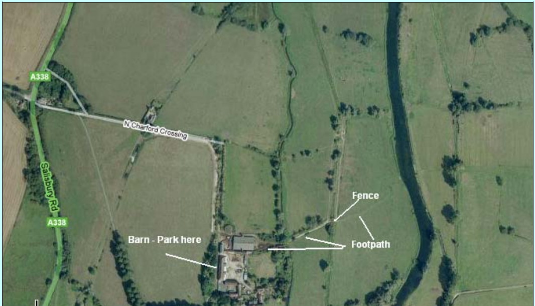
Downton Stretch 3

Go through Downton, over both river bridges until you reach the traffic lights, turn left towards Fordingbridge. About 1 mile down the road there is an obvious "s" bend turn left down the gravel track on this bend there are 2 tracks and either will do because they join up. Follow the track round to the right you should see some farm buildings, park next the big barn on your left hand side. You should see a sign on the side of the barn saying "Downton AA". Park close to the barn so as not to impede farm machinery. Walk back, away from the barn and you should see a metal farm gate on your right, go through the 2 gates and carry on down the footpath-over a small feeder stream, then another gate, soon the footpath turns sharp left, with a meadow in front of you. Climb over/under the barbwire fence (sometimes the farmer has the fence opened up) and walk straight across the meadow to the river. Please close all gates behind you. You can go upstream to the old railway pilings, or downstream to where the river forks.