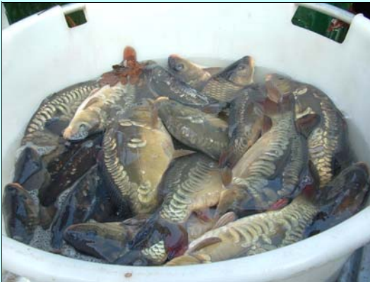
Some of the smaller carp