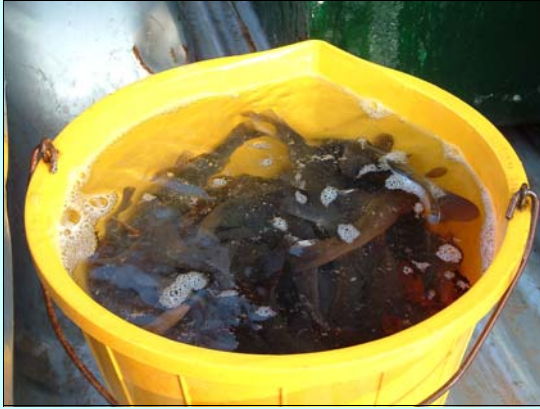
A bucketful of tench