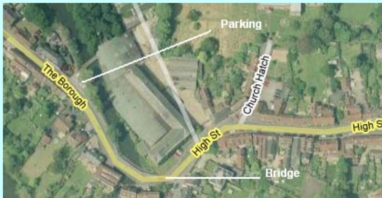
Downton Stetch 1

This is a short stretch of fairly static water, that backs up behind a weir to the Moot stream. Locally it is known as 'Tannery Stretch' because it is opposite the old tannery building (now converted into "des res").