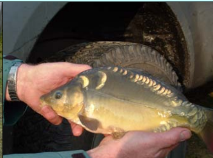
Two nice looking fish which will grow on to grace someone's net!