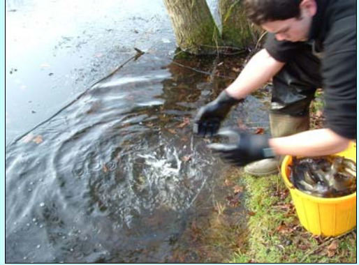
Tench going into Storrington