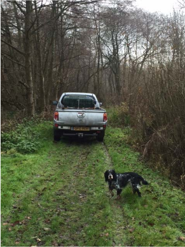
The fish arriving with Mick G's dog standing guard!

As the fish were put in they spread out quickly across the pond and seemed to like their new surrounding. We hope that the roach and skimmers will liven up the fishing during the colder months and the tench will grow on to give some added interest during the summer.