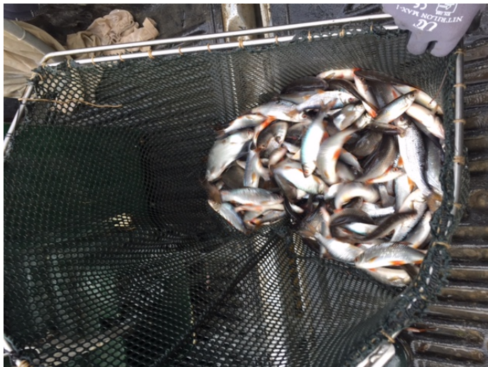
A couple of the nets of fish that went into the Match Pond