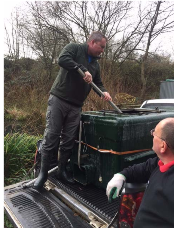
Unloading the fish from the tank

We have put in 100lb of roach, these are a mix of sizes 100 skimmer bream, these are generally 4 - 6 inches long with a few that are a bit bigger 100 tench again these are around the 4 - 6 inch mark.