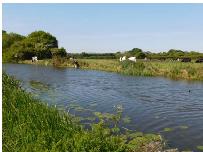
Chichester Canal just below Hunston bridge. There are platforms along this stretch so you can tuck yourself in off the towpath.

Having fished the canal a few times I can tell you that it is absolutely full of fish. There are loads of Rudd up in the water and these can prove a nuisance if you are fishing with small baits such as maggot and pinkie. I have found that changing to corn on the hook over a bit of groundbait is the best approach for the Roach and Skimmers.