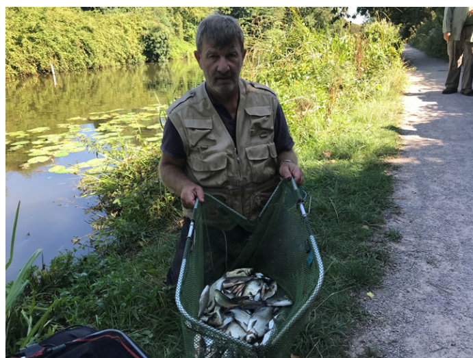
A typical net of canal Skimmers and Roach from the depth marker area